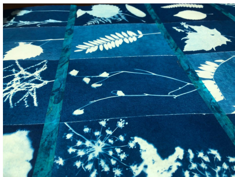
Exhibit description from the library website --

Photo: cyanotypes made by Camel's Hump Middle School students in our Artists in Residence program, led by Renée Greenlee.