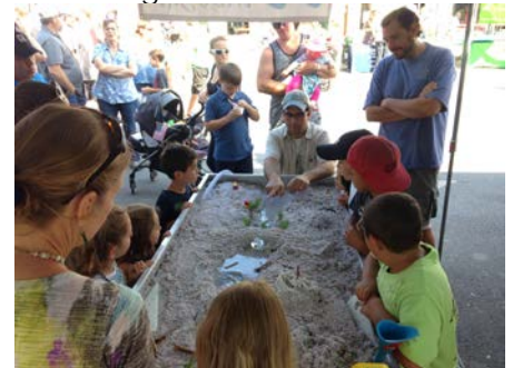
Stream table in action in Northfield!

Stream Table: The Friends bought a stream table in 2016! The table is a fantastic education tool for students, municipal officials and the general public. In 2017, we will train teachers to use the table with their students. We will also develop a lending protocol so other organizations can take advantage of it.