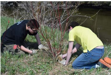
Students from Twinfield School planting a red osier dogwood along the Winooski River

Riparian Protection: We work with landowners to improve streamside buffers that help reduce erosion and improve water quality and habitat. In 2016, we planted 2,250 trees and shrubs on five properties (~6.5 acres) throughout the watershed. We also did site maintenance such as removing competing vegetation including knotweed from around newly planted trees on 8 acres at 5 restoration sites. Site maintenance improves growth and survivorship, accelerating buffer function.