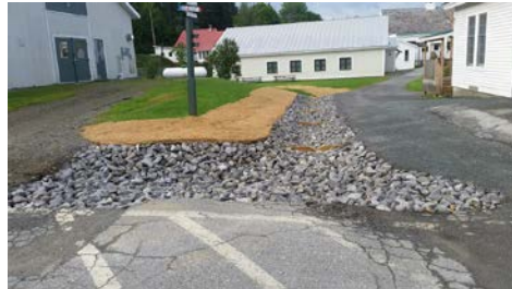
One of the swales at the Cabot School

Floodplain Restoration: In Northfield, we completed the final design for a floodplain restoration along the Dog River on properties that were purchased post-TS Irene. Working in partnership with the Town, we anticipate completing the restoration in 2017. The restored floodplain will reduce flooding and improve water quality as well as provide passive recreation space.