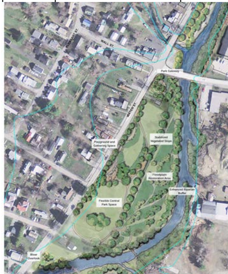
Restoration area and rendering of park.

Floodplain Restoration: In Northfield, we completed the final design for a floodplain restoration along the Dog River on properties that were purchased post-TS Irene. Working in partnership with the Town, we anticipate completing the restoration in 2017. The restored floodplain will reduce flooding and improve water quality as well as provide passive recreation space.