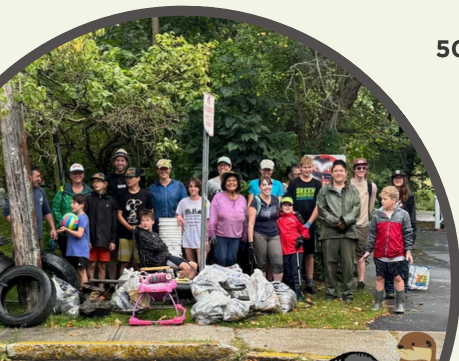
Elm Street Cleanup Site