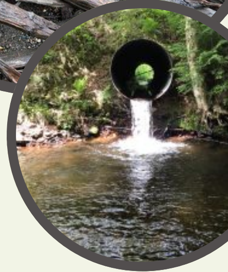
Jockey Hollow Dam