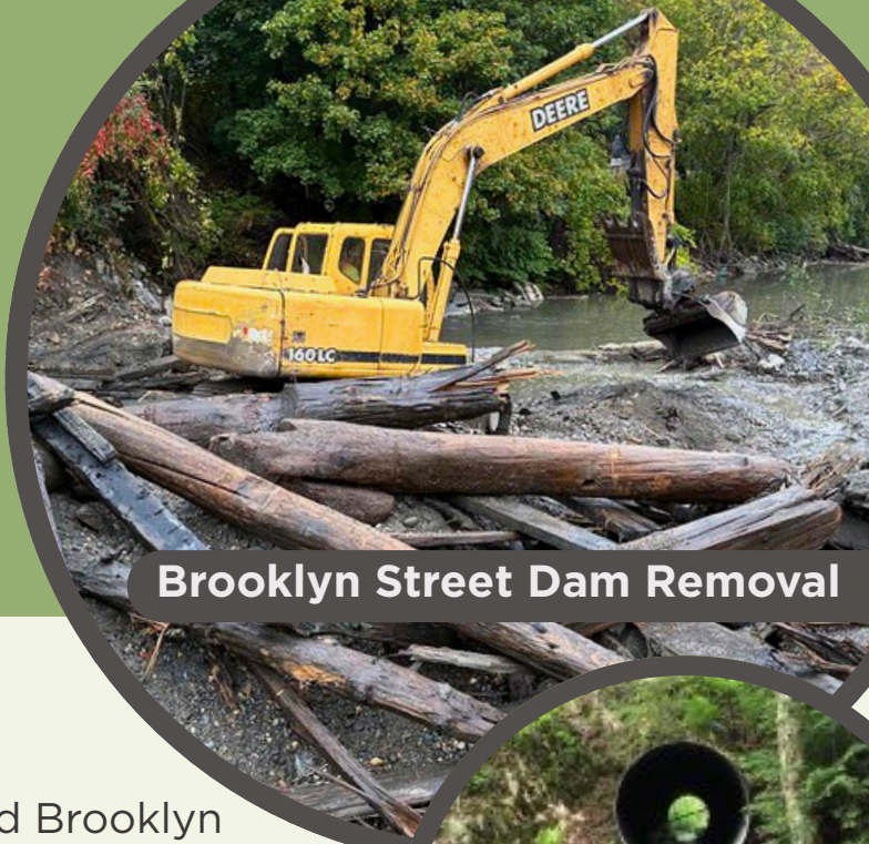
Brooklyn Street Dam Removal

We removed two dams - Jockey Hollow and Brooklyn Street - along the Stevens Branch in Barre this summer, with a third planned for 2026! Removing this series of three defunct dams will open four miles of high-quality stream habitat for wild trout. These large, engineered projects also reduce flood risk to homes, businesses, and roads. We are managing 10 additional projects in design phase.