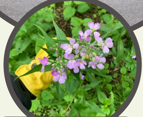
Invasive Dames Rocket