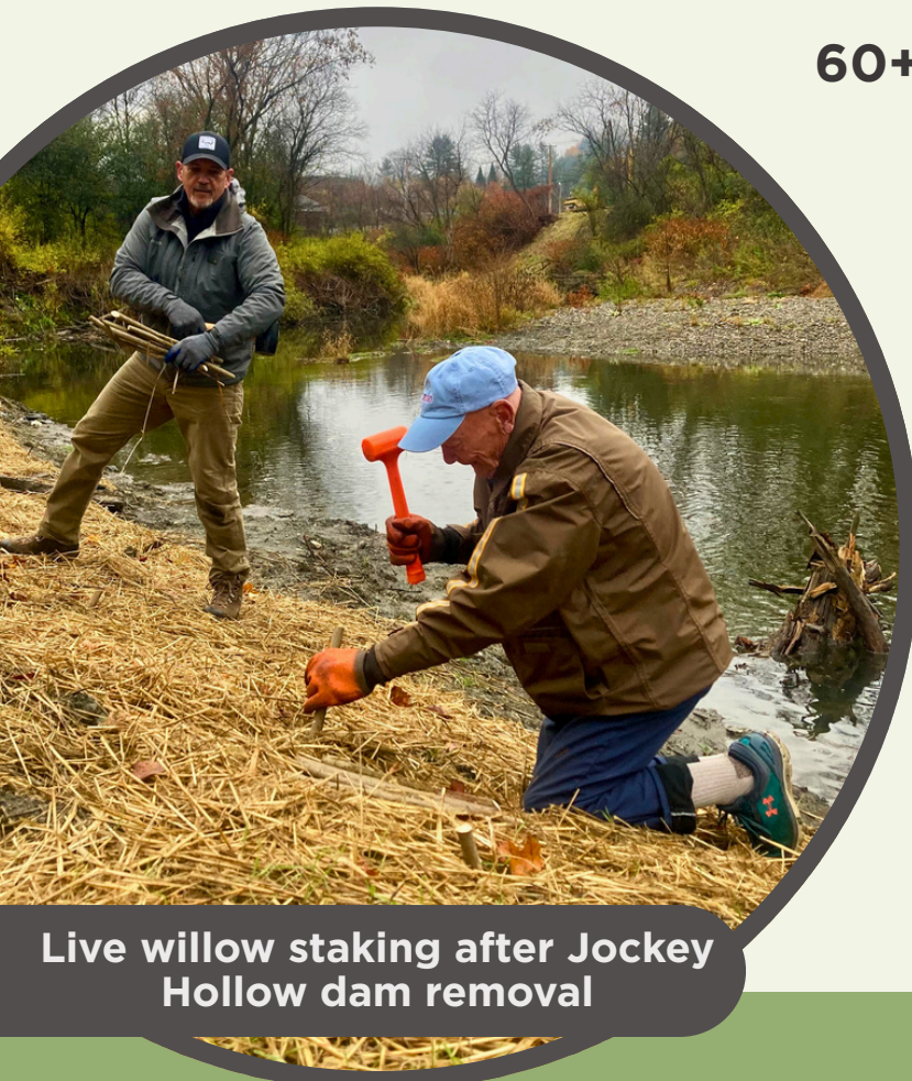
Live willow staking after Jockey Hollow dam removal